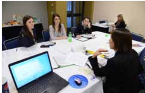
Above: Resolutions authors met with the Resolutions Committee on Thursday evening.